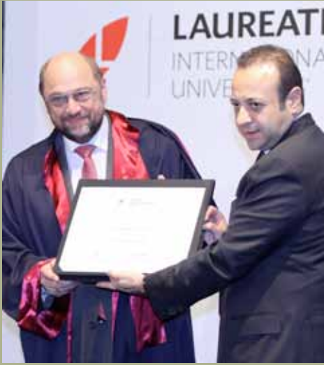
Martin Schulz, President of the European Parliament, Egemen Bağış, Minister for European Affairs and Chief Negotiator.