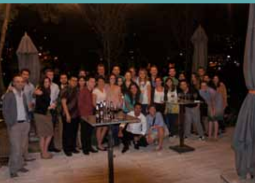
"The New Academic Year Opening Cocktail of CIFE was held at Tamirhane on 15 October, 2012"

With its various university partners from different countries, a study trip and a dialogue with experts and stakeholders from politics and business, the program offers a unique and extraordinary experience. By taking part in this high-level academic program, students can experience real-life "European integration" by living the EU motto, "Unity in diversity".